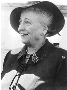
Pearl S. Buck: Pearl S. Buck was an inspirational American writer who is most widely known for her Pulitzer Prize-winning novel The Good Earth where she describes peasant life in China, a country that she resided in most of her life.