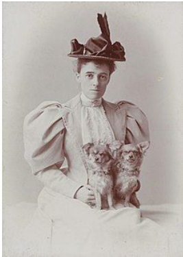
Edith Wharton: Edith Wharton was an American novelist who was the first woman to win a Pulitzer Prize for literature for her novel The Age of Innocence .